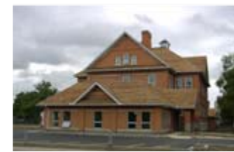
Montreal Street School, 1904