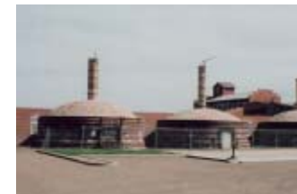
Medalta Potteries, 1912-1950