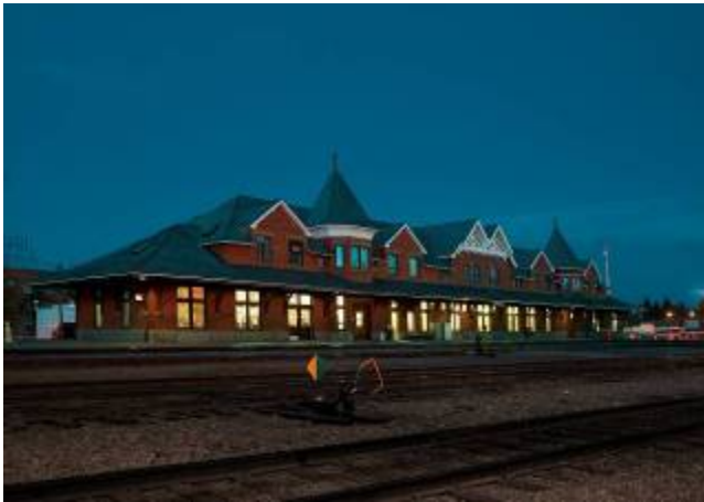
Canadian Pacific Railway Station, 1906