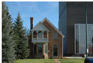
Ewart Duggan House, 1895