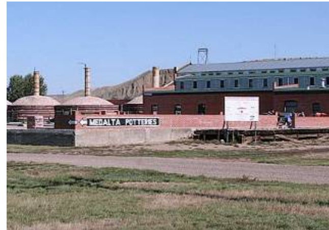
Medicine Hat Clay Industries National Historic Site (1909-1946)