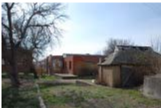
Hycroft China, 1937