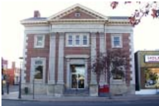
Canadian Imperial Bank of Commerce, 1908