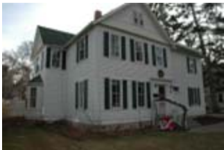
Cousin's House, 1896