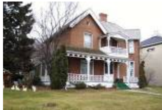
Crawford House, 1901