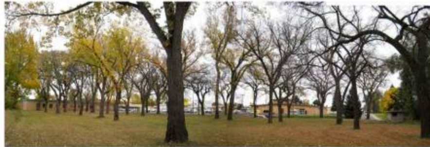
Heritage Overlay District focuses on historic buildings, landscapes and cultural elements contained in this area. Plans identify the cultural elements and landscapes that may be subject to development or change in the future.