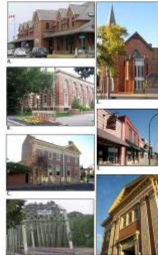
A few examples of the historic architecture and buildings in the Downtown area are shown in the photographs. The photographs show the historic architecture and buildings in the Downtown area. The photographs show the historic architecture and buildings in the Downtown area.