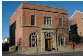
Cypress Club, 1907